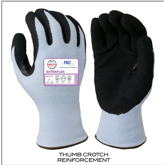
THUMB CROTCH REINFORCEMENT